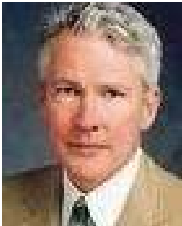
Professor Philip Bobbit Former Presidential Advisor

“In some circumstances the use of violence to save innocent lives is effective. It won’t do simply to assume that this will never happen, that persons under coercion always lie, that information can be gained in a timely way by other means or from other sources. Such assumptions inadvertently lead directly to the sort of lawless behaviour we have regrettably seen” (May 27, 2008).