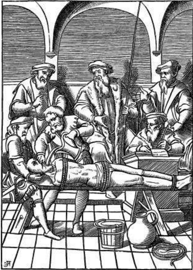
Fig. 341.—The Water Torture.—Fac-simile of a Woodcut in J. Dambouïdre's "Praxis Rerum Criminalium:" in 4to, Antwerp, 1556.